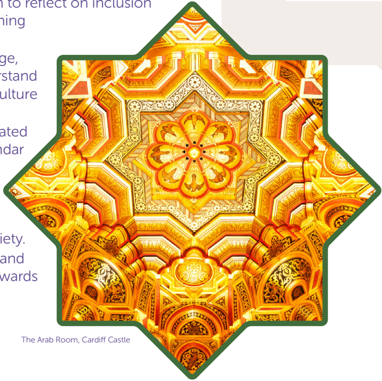
The Arab Room, Cardiff Castle