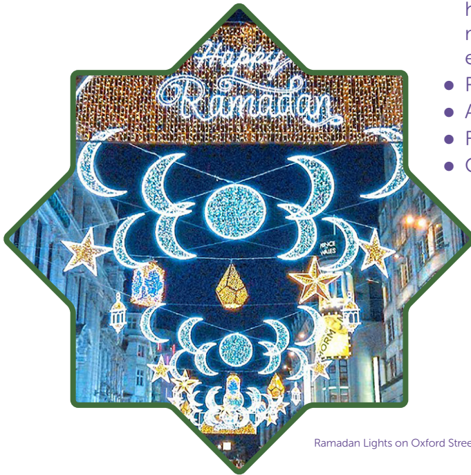
Ramadan Lights on Oxford Street, London